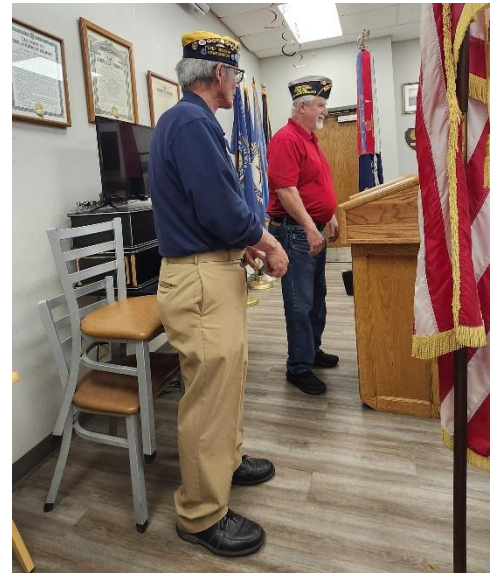
Left Picture: S/M Jr. PRPNC Addressing the Assembly talking about his running for NVP 2026-2027. He also touched on pushing membership.