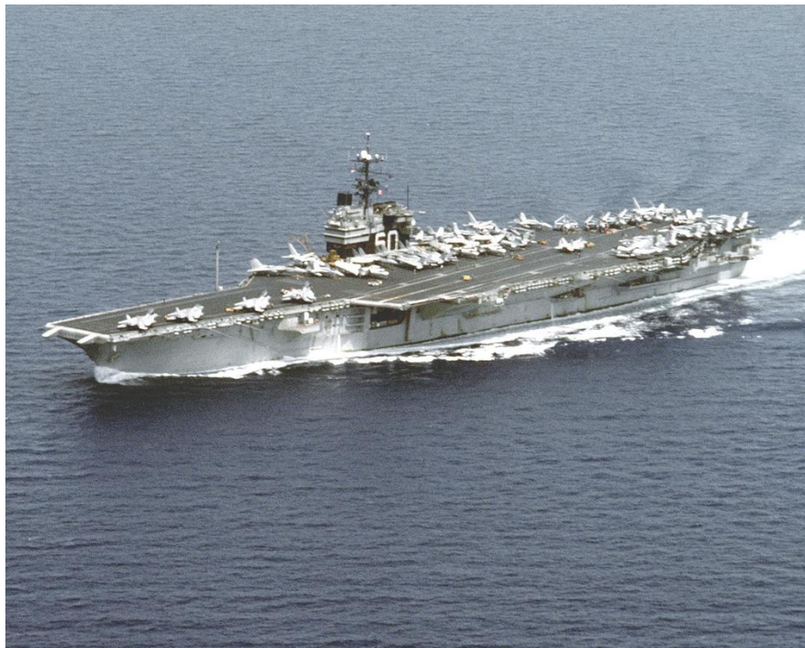
Teddy Verfurth's 2 nd Ship USS SARATOGA (CV-60)