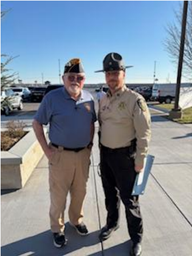
Presentation of Ozark Empire Branch 316's donation to the Christian County Sheriff's Department in memory of the 2 slain deputies.