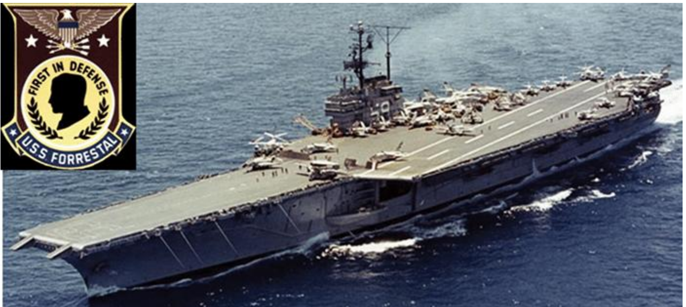
USS Forrestal (CVA-59, later CV-59, and AVT-59) Teddy Verfurth's 1 st Ship