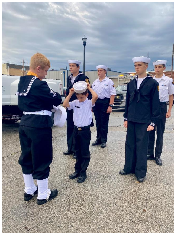
The Cadets attended the Maple Leaf Parade in Carthage, MO on October 18 th . LPO was instructing the youngest new Cadet on how to wear his white cover.