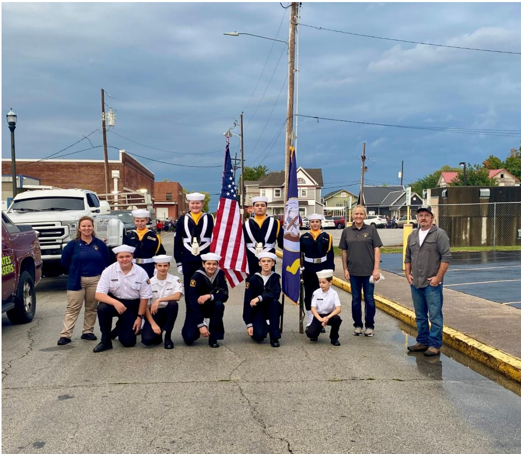
Sea Cadet Unit Greater Ozarks Division Sponsored by Ozark Empire Branch 316 FRA