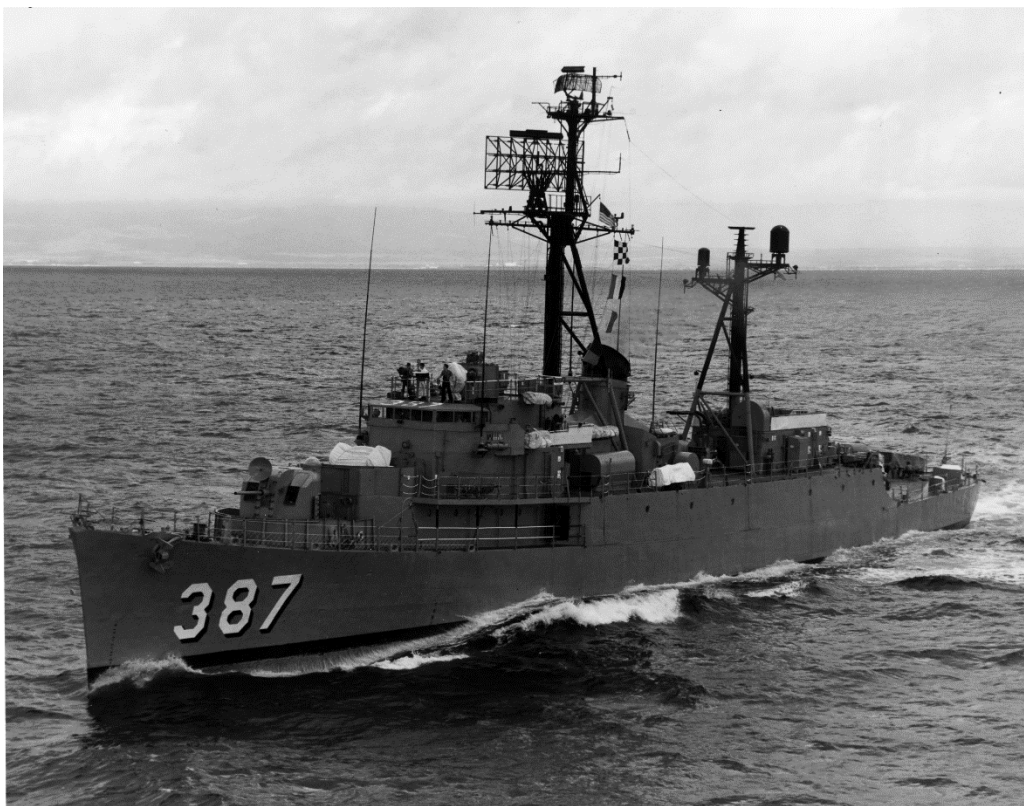
USS Vance (DER-387) Don Brunk's 2 nd Ship