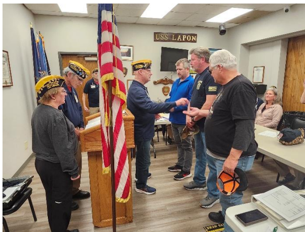
S/M Secretary Presenting the S/M's with their FRA Pin