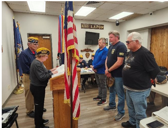
S/M Vice President Instructing the S/M in Loyalty, Protection. And Service