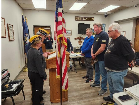
S/M President Starting the Initiation