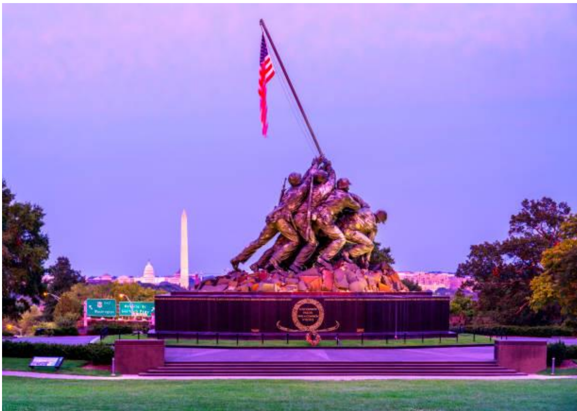
Marine Corps War Memorial, Washington DC