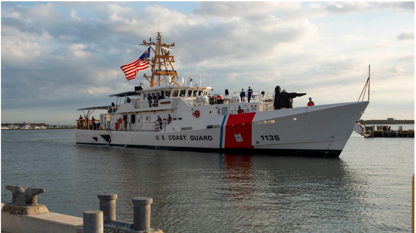
Coast Guard cutter Forrest Rednour (WPC-1129) First in a Quartet of New Coast Guard Cutters Arrive in Los Angeles