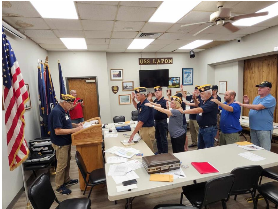
Branch Officers Taking the Oath of Office June 27, 2024