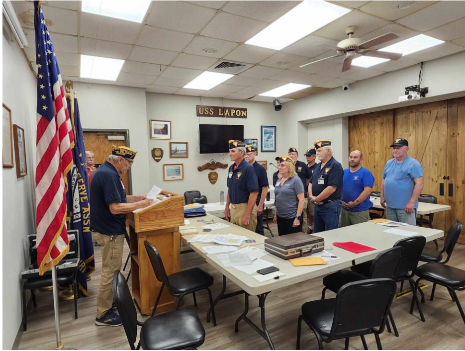
Installation of Branch Officers June 27, 2024