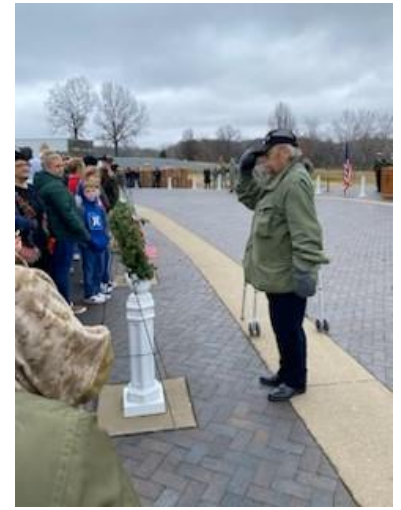
Army Wreath Presenter