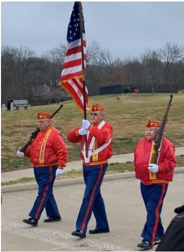
Marine Corp League