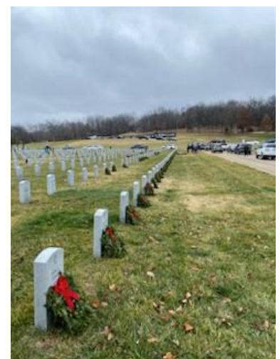
After Ceremony Volunteers Laid over 500 Wreaths. Br 316 paid for 25 Wreaths