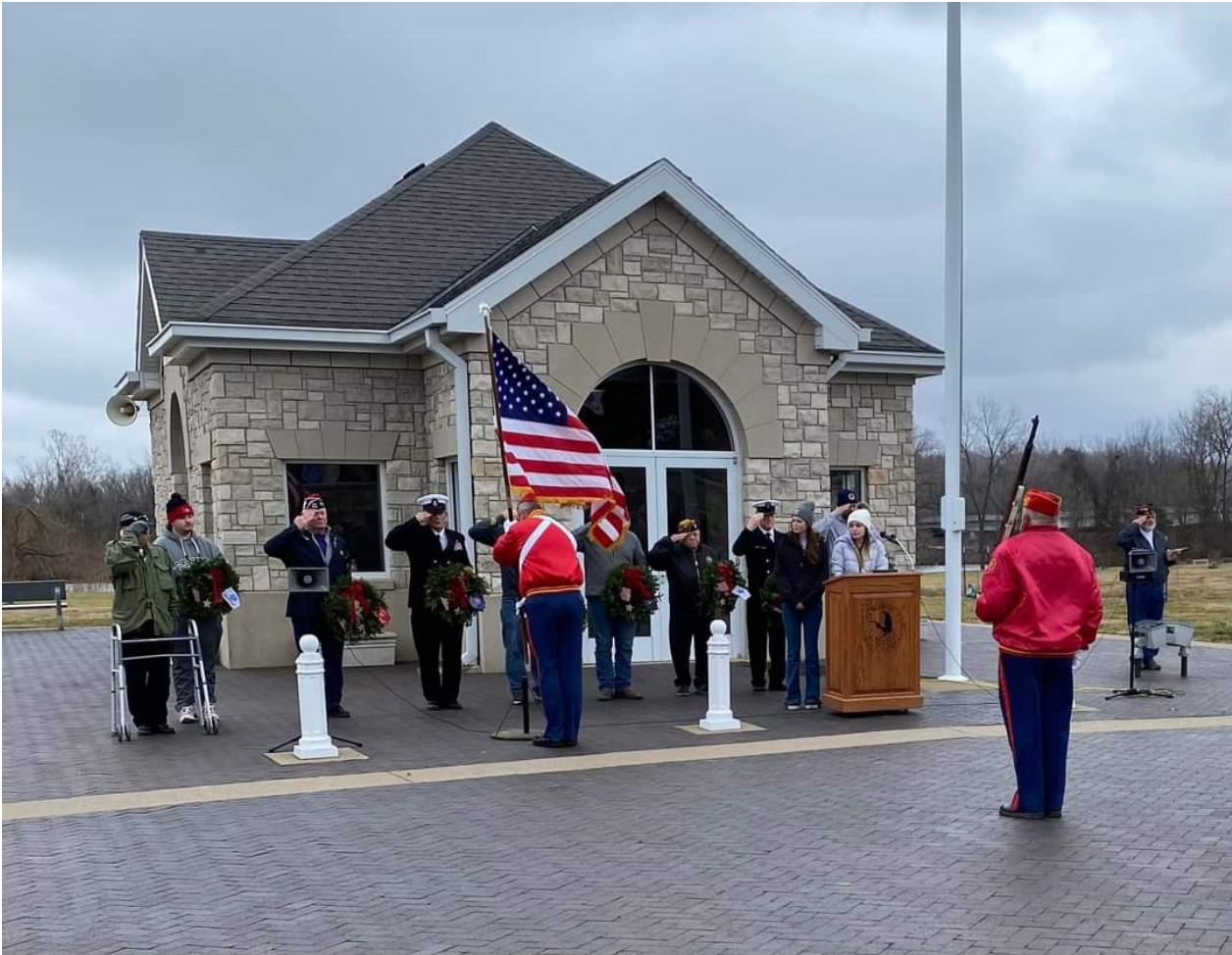
Posting of Colors