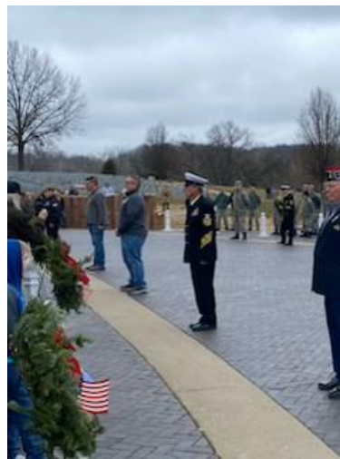
After Presenters Placed their Wreaths