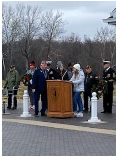
Wreath Presenters "Army, Marines, Navy, Air Force, Space Force Coast Guard, MM, POW/MIA