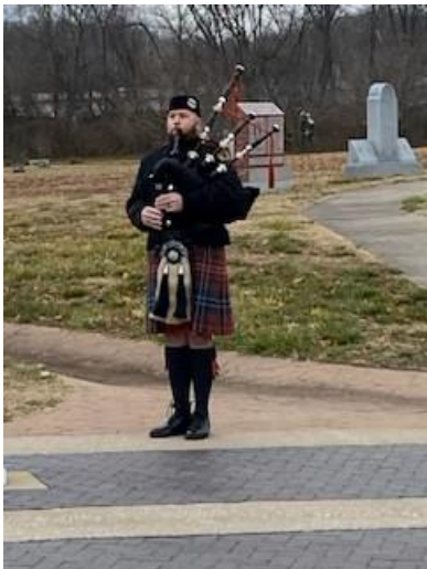
Bag Pipe Player