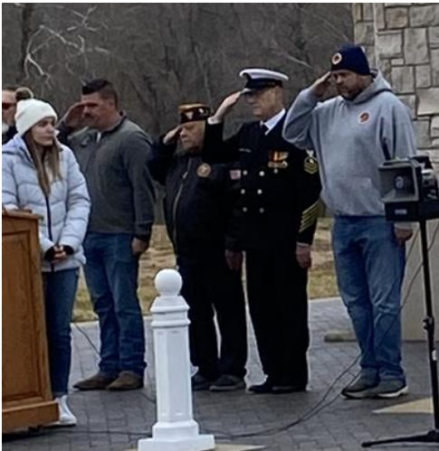
Pledge Of Allegiance