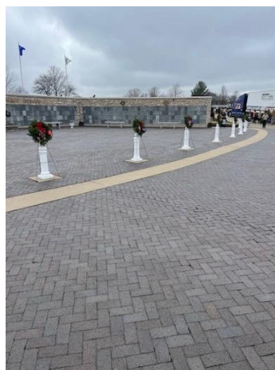
All Stations: After Wreaths Were Laid.