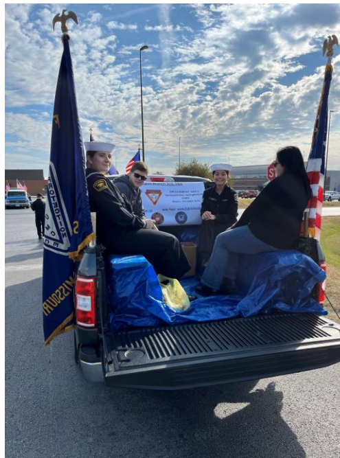
Willard Veterans Day Parade, November 4, 2023 Greater Ozarks Sea Cadets Sponsored by Ozark Empire Branch 316 FRA