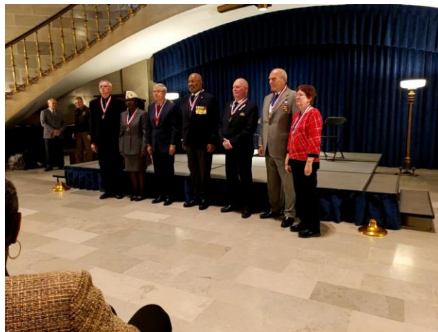
All inductees into the Missouri Veterans Hall of Fame being honored on October 27, 2023