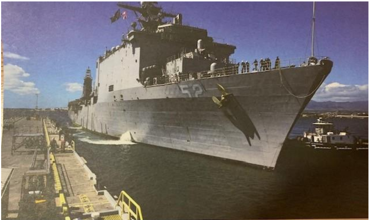
The USS Pearl Harbor (LSD – 52), with the embarked 15 th Marine Expeditionary Unit (MEU), arrives in Pearl Harbor as part of the America Amphibious Ready Group under the operational control of Amphibious Squadron (PHIBRON) 3.