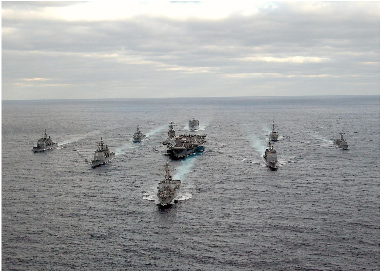
USS George Washington Carrier Strike Group Underway in the Atlantic