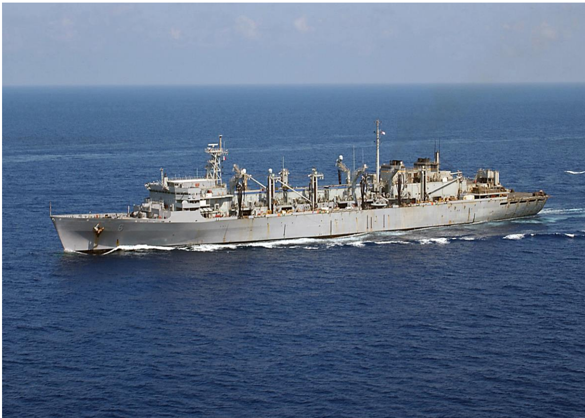
USNS Supply (T-AOE-6)