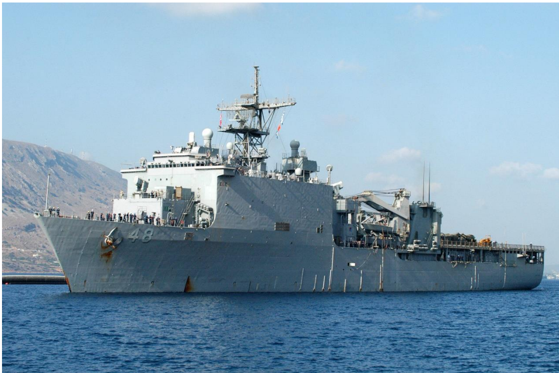
The dock landing ship USS Ashland (LSD 48) in Souda Bay, Crete, Greece