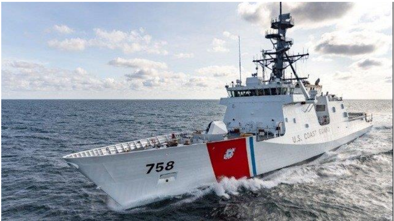
Newest US Coast Guard Cutter Stone Undergoes Sea Trials