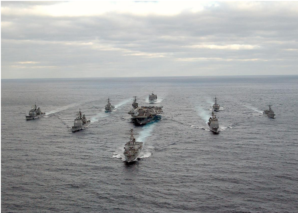
USS George Washington Carrier Strike Group Underway in the Atlantic