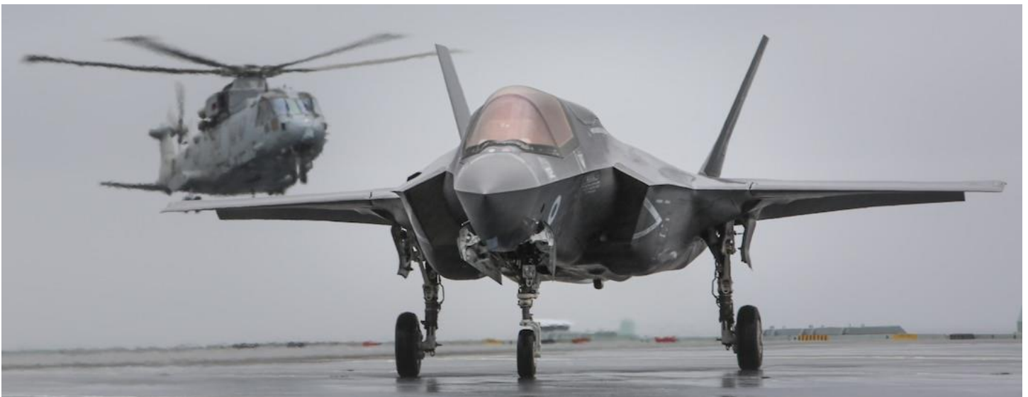
An F-35B Lightning II taxis into position on the flight deck of HMS Queen Elizabeth at sea, Sept. 23