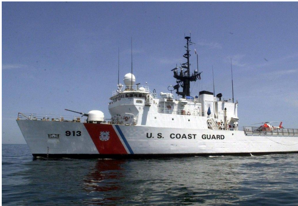
USCG Cutter Mohawk Gets New Commander - Naval Today