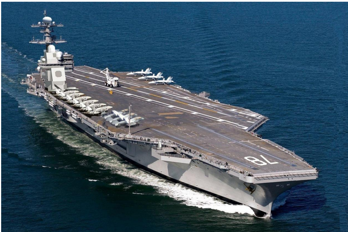
USS Gerald Ford, CVN 78