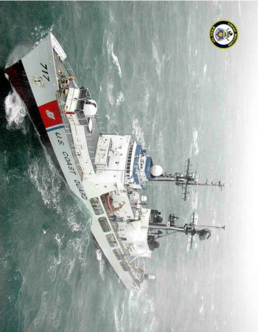
USCGC MELTON WHERC 717