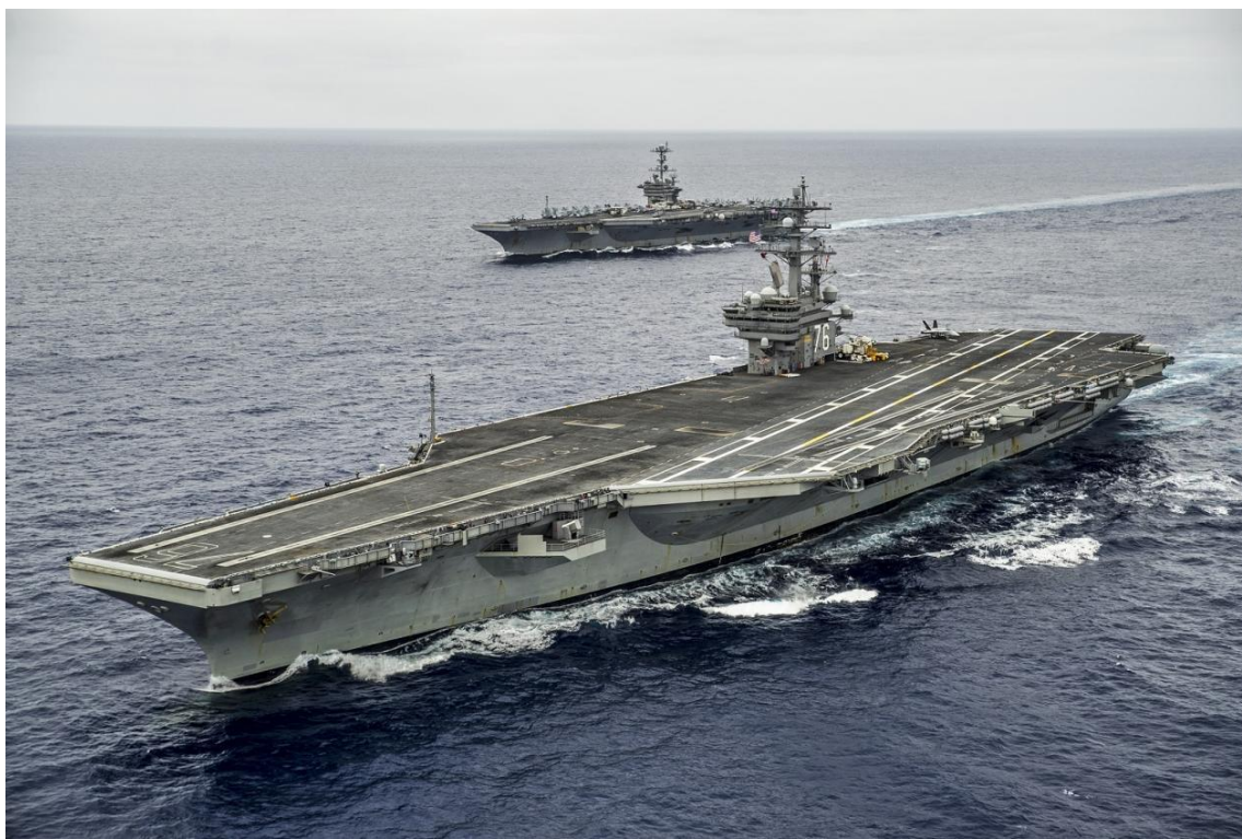
USS Ronald Reagan (CVN-76)