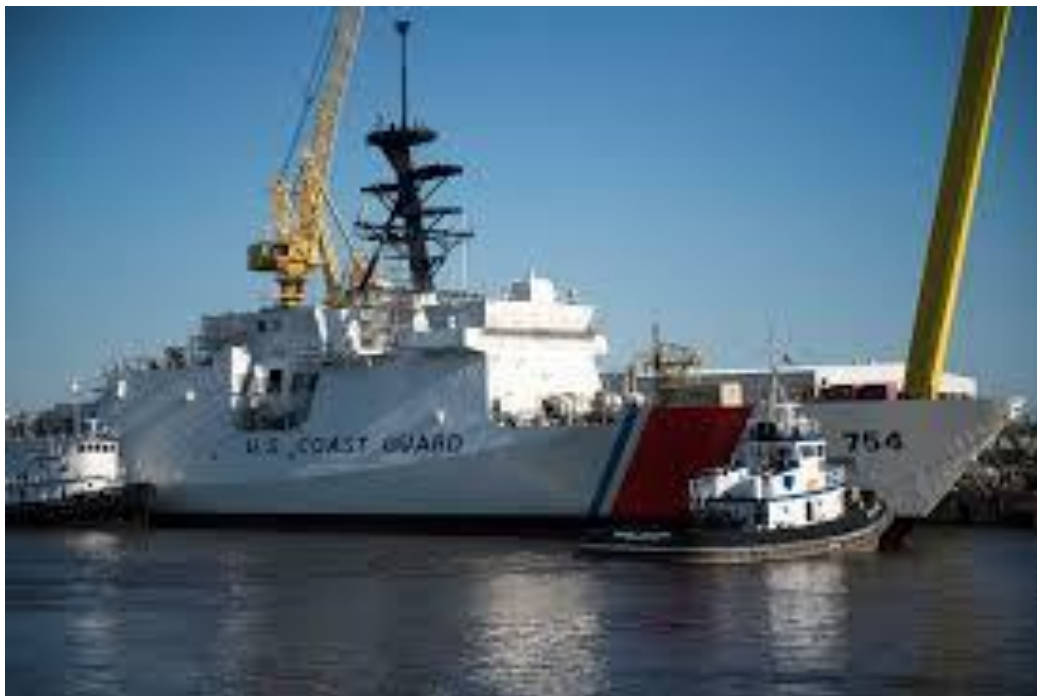
Ingalls Shipbuilding Launches Fifth National Security Cutter James (WMSL 754) at PASCAGOULA, Miss. (May 6, 2014)