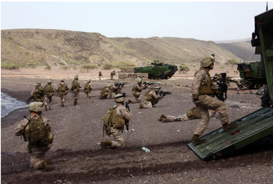
Marines with Alpha Company, Battalion Landing Team 1st Battalion, 2nd Marine Regiment, 24th Marine Expeditionary Unit, assault a beachhead during an amphibious training raid in Djibouti, Aug. 15, 2012.