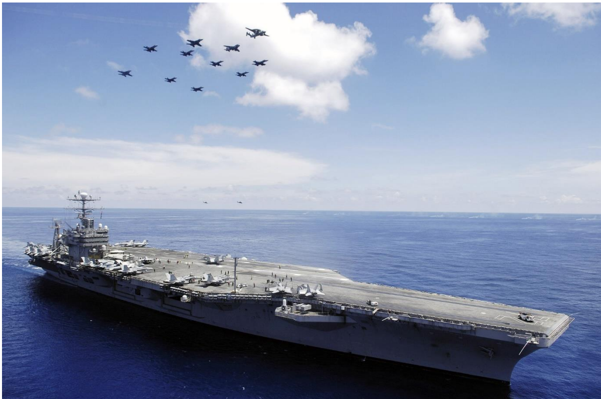
Abraham Lincoln underway, with aircraft overhead, in the South China Sea , 8 May 2006