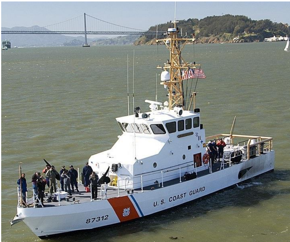
Telstar Logistics on the deck of the USCG Hawksbill