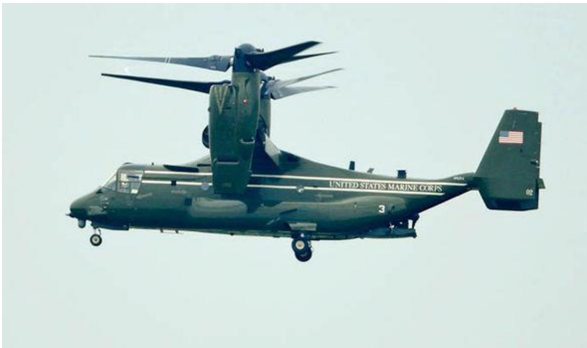
US Marine Corps - MV22 Osprey aircraft