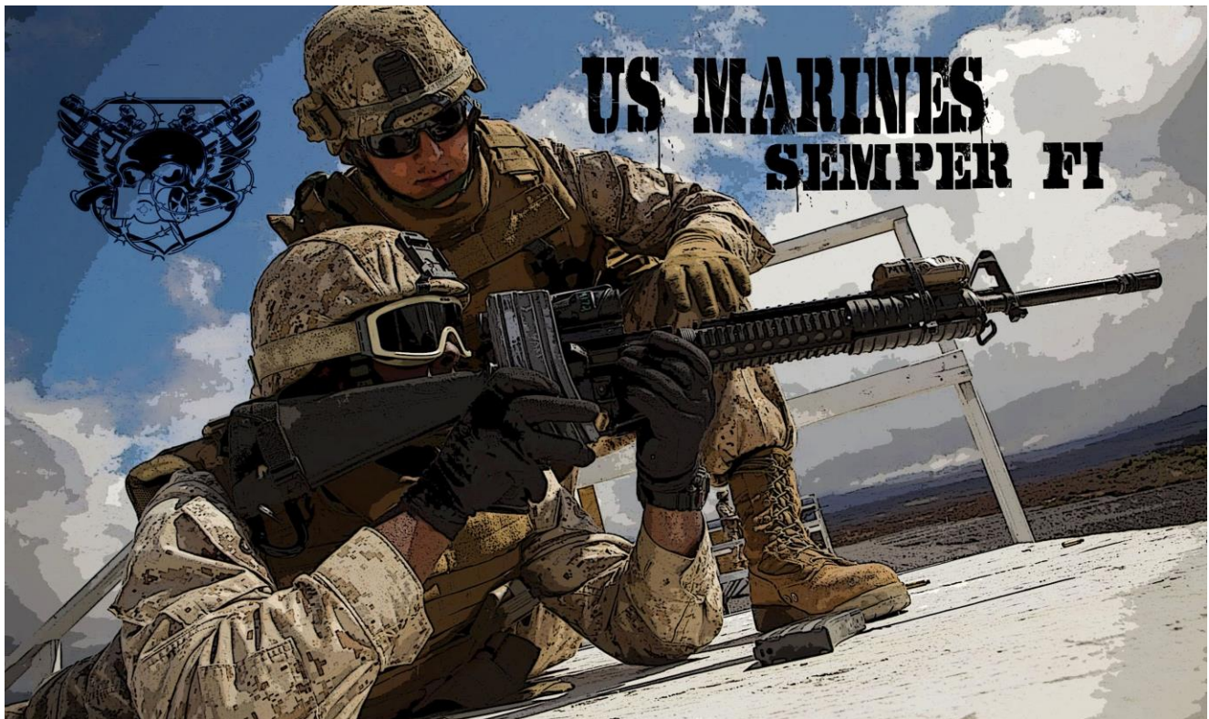
US Marine Corps – First to Fight